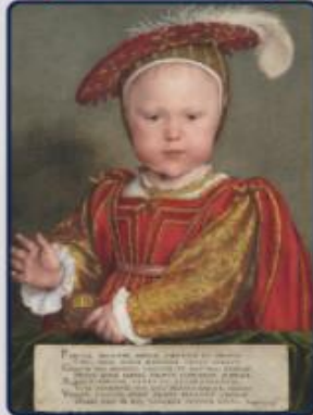
Edward VI as a Child, 1538