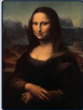
Mona Lisa, 1503-06